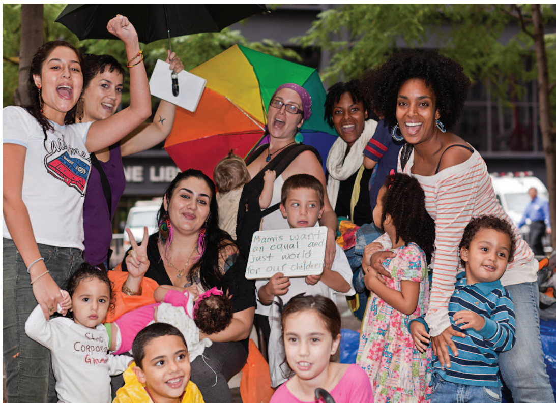
WE'RE ALL IN THIS: The occupation has spread beyond its first days to include an increasing number of families, local union workers, teachers and students from across the five boroughs.