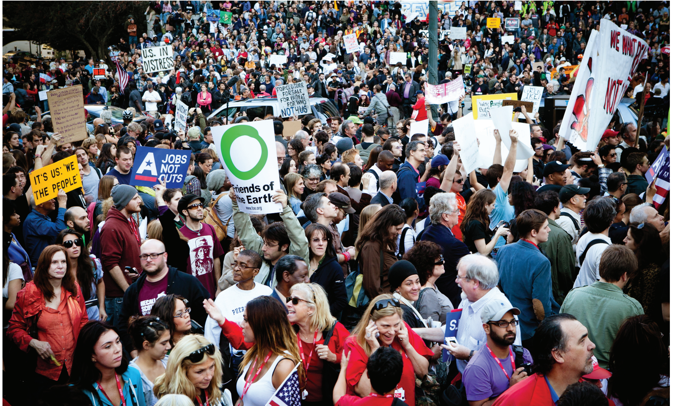
NEW YORK TURNS OUT TO OCCUPY WALL STREET: Labor unions and student walkouts brought tens of thousands to Foley Square on Oct. 5. After dusk, crowds filled lower Manhattan around Zuccotti Park, re-named Liberty Square by the occupation. Despite high spirits among the protesters and no incidents of violence or vandalism, NYPD officers arrested numerous people. Pepper spray and batons were also deployed.