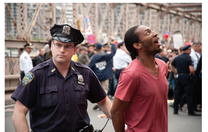
UNAFRAID: Despite 700+ arrests on the Brooklyn Bridge on Oct. 1, crowds surged in the following days.