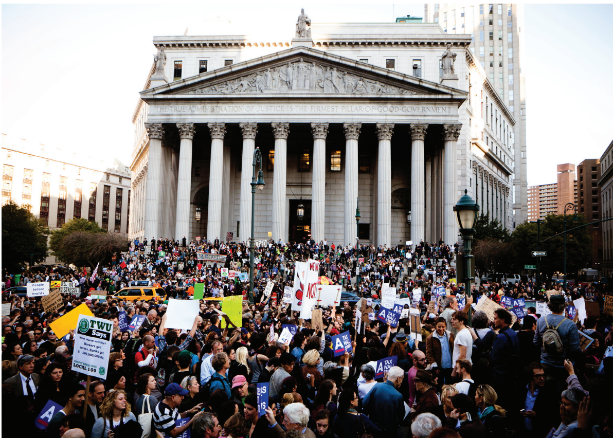
FOLEY SQUARE, OCT 5.

“The United Steelworkers union, North America's largest industrial union with 1.2 million active and retired members, stands in solidarity with and strongly supports Occupy Wall Street. The brave men and women, many of them young people without jobs, who have been demonstrating around-the-clock for three weeks in New York City, are speaking out for the many in our world. We are fed up with the corporate greed, corruption and arrogance that have inflicted pain on far too many for far too long. Our union has been standing up and fighting these captains of finance who promote Wall Street over Main Street. We know firsthand the devastation caused by a global economy where workers, their families, the environment and our futures are sacrificed so that a privileged few can make more money on everyone's labor but their own.”